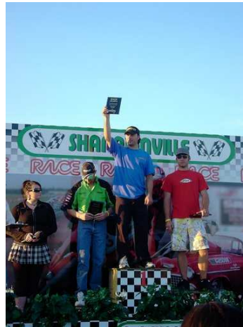
Final RACE Round

numerous mentions in media reports and a great 4-page feature in Road Racing World (January 2006) that brought us invitations to race in the US and Europe. I hope to race more and more in different parts of the world..."