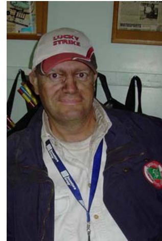
Why no! Its...