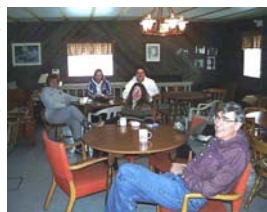
Sunday morning social