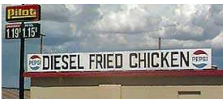
Sounds tasty, doesn't it?