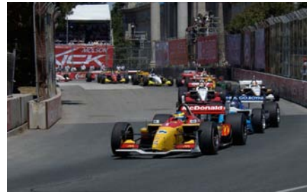
Toronto Indy 2005

The team is expected to contest several US rounds as pre-season testing.