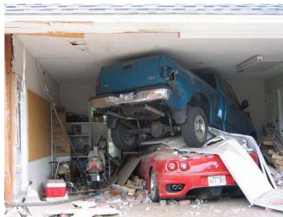
P.S. Your girlfriend called