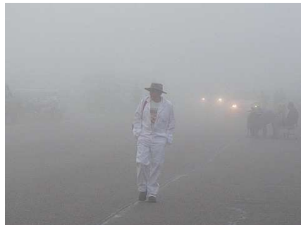
One of the challenges at last year's event...finding the track!